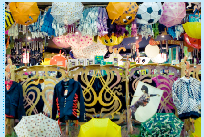
Take flight from the mundane at the unconventional Grand Central Hall

Make your last stop the Albert Dock for a spot of Liverpoolian memorabilia hunting, some gadget coveting at the Apple Store, or a cultural purchase at the Tate. Wallets at the ready.