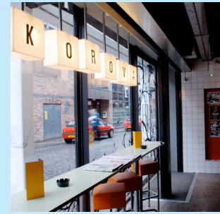
Clockwise from left: the stylish Room bar at 62 Castle Street hotel; music lover’s mecca, Korova; dancing the night away at vibrant Alma de Cuba

Ready to dance we join the queue at Alma de Cuba where a carnival appears to be in full swing. There’s a crush at the bar so we take advantage of the convenient table service. This was once St Peter’s Catholic church and the Madonna images, stained glass windows and