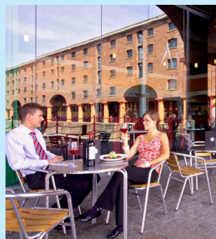
Grade I-listed architecture and styishi cocktails await at PanAm

After this artistic feast, I head to airline themed bar PanAm to digest what I've seen over a fruity Panamopolitan and stunning views of the sunset over Albert Dock. If it wasn't for the instantly recognisable Liver Building, a snapshot of this view could easily be mistaken for Barcelona or New York. Liverpool looks beautiful from here.