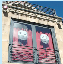
Clockwise from top left: captivating art at the Niki de Saint Phalle exhibition; Visible Virals at Met Quarter; Geisha bar

Scouse-style box) where the Visible Virals art project has sited one of its first pieces: a set of gold scales which can tell you if you weigh as much as the potatoes a family eats in a year, or the bananas a person eats in 10. Fascinating and accessible, this is art for the masses.